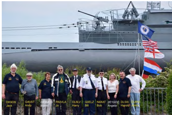
Our radio crew with flagpole in front of U-995