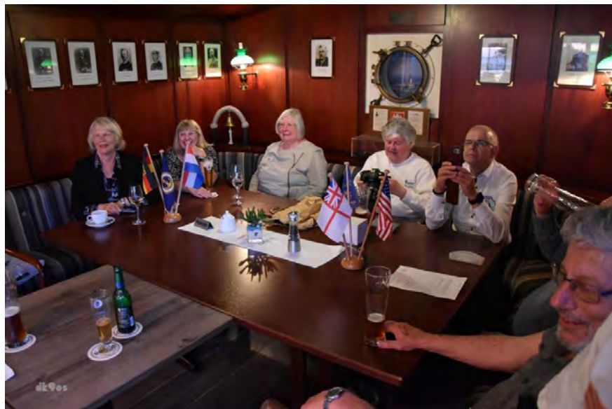
U-995 friendship crew in the Captain's Corner in Admiral Scheer

We are looking forward to seeing all of you again in 2020.